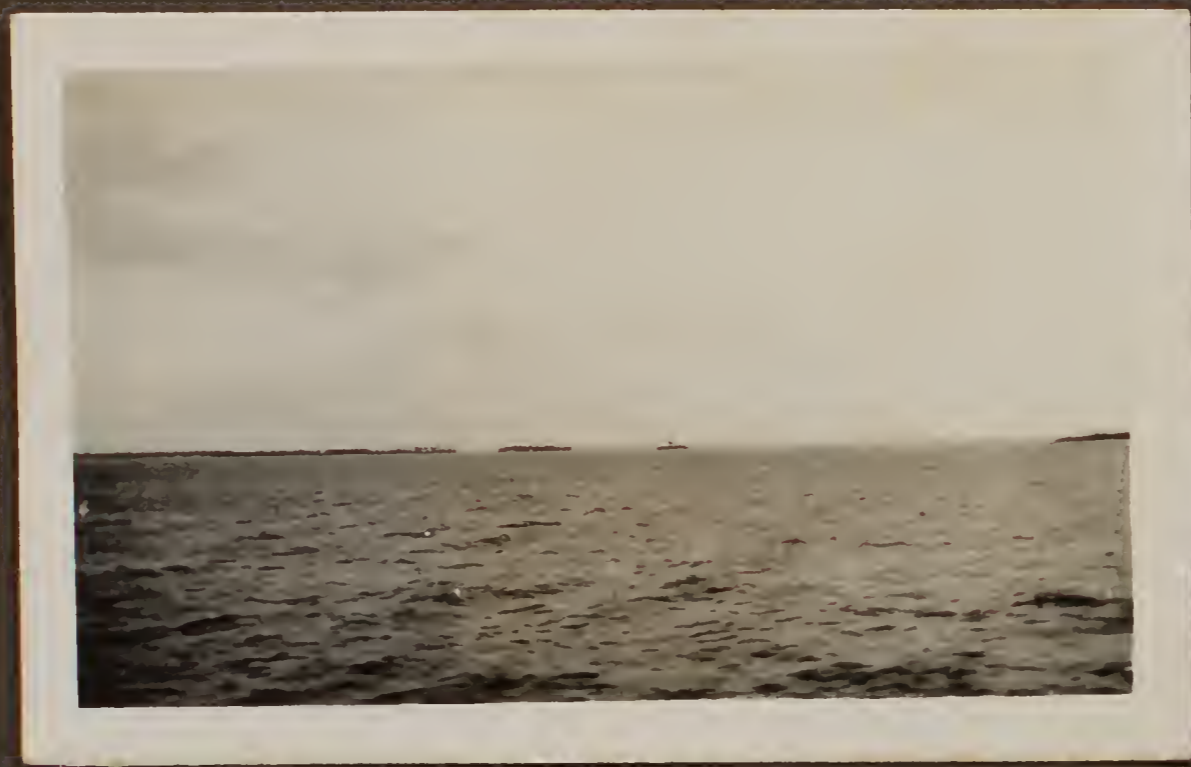
Cocos Keeling Atoll 20. 11. 28